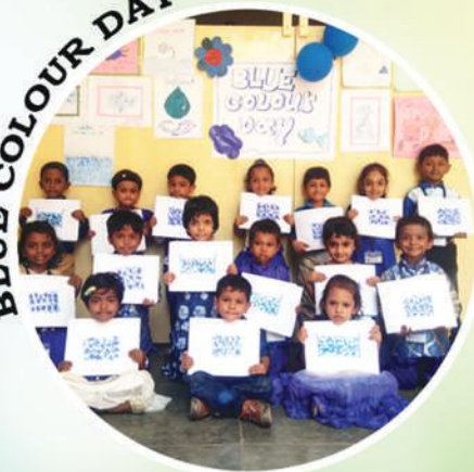
BLUE COLOUR DAY