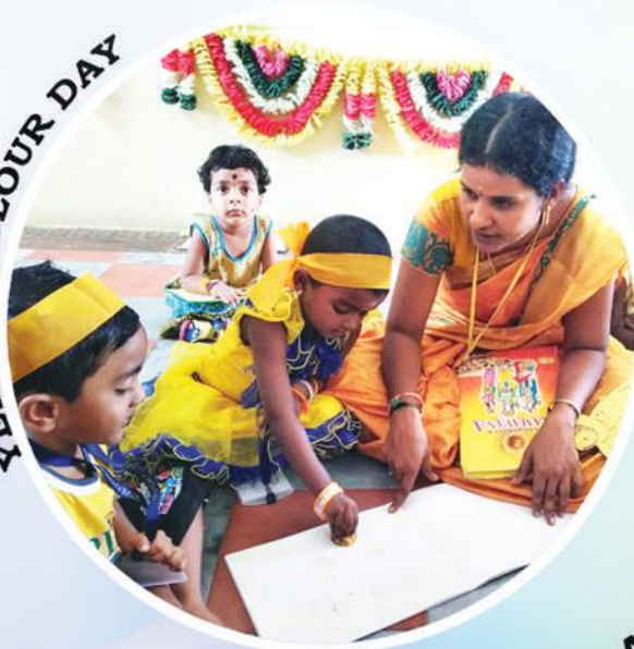
YELLOW COLOUR DAY