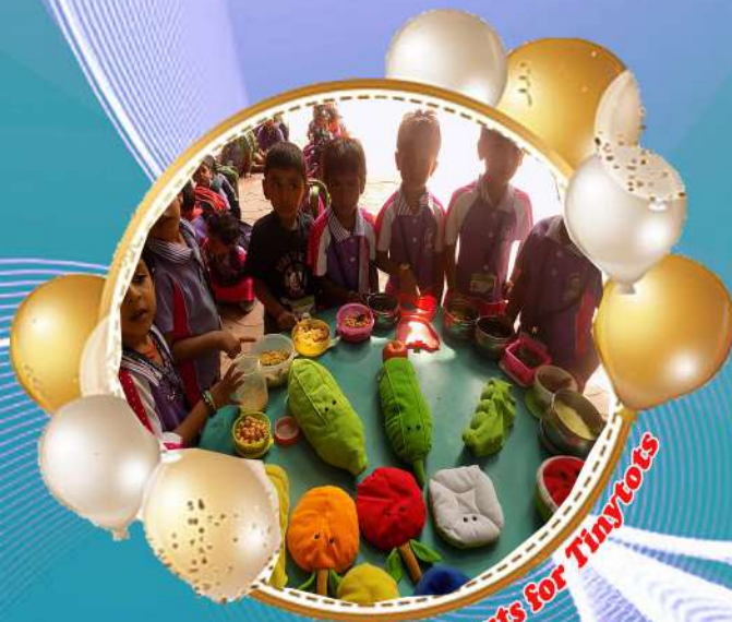
Creative Handouts for Tinytots