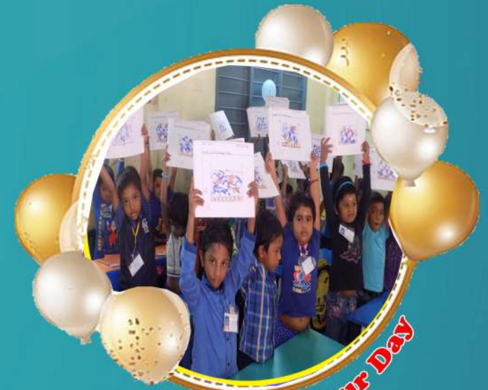
Blue colour Day