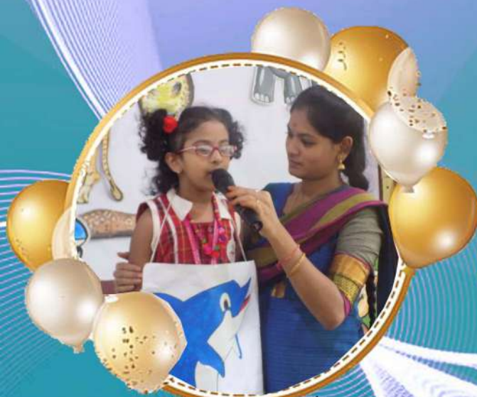
Show & Tell

LIFE SHOULD NOT BE LIVED IT SHOULD BE CELEBRATED