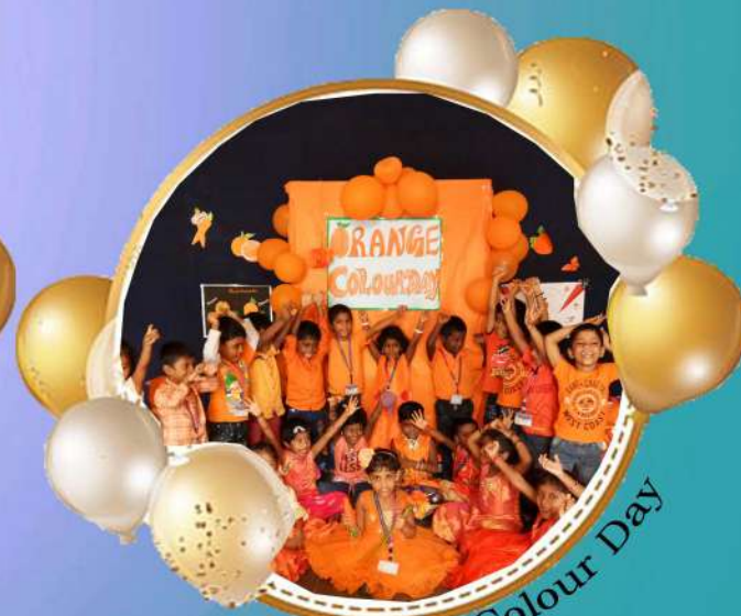
Orange Colour Day