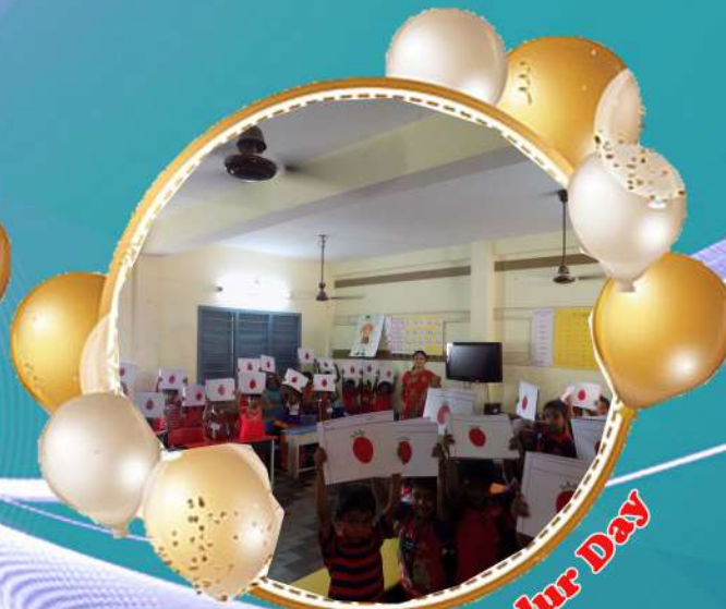
Red Colour Day