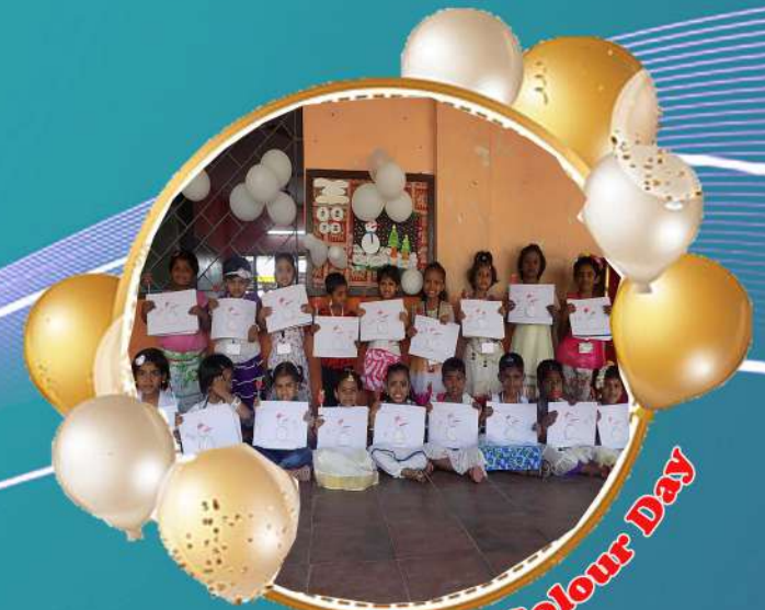
White Colour Day