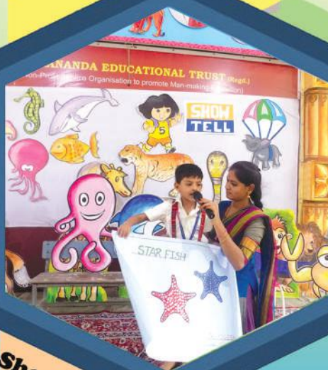
Show and Tell