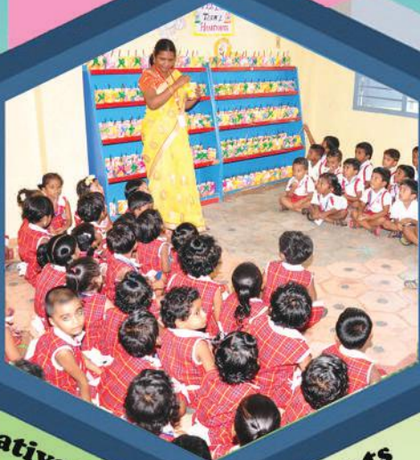
Creative Handouts for Tinytots