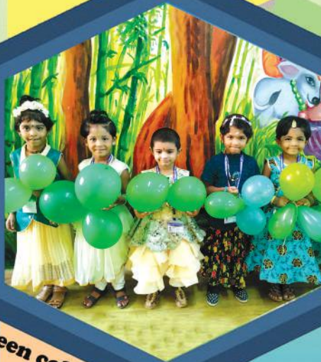
Green colour Day