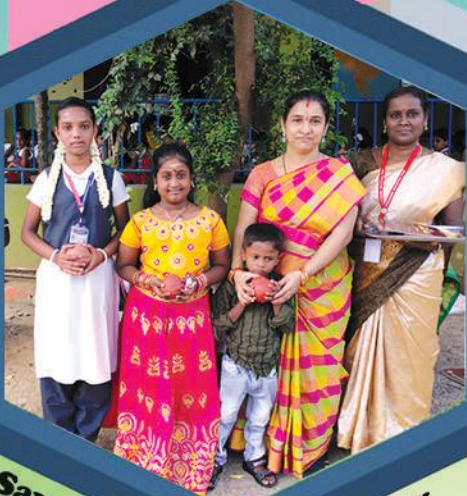
Save to a cause on birthday