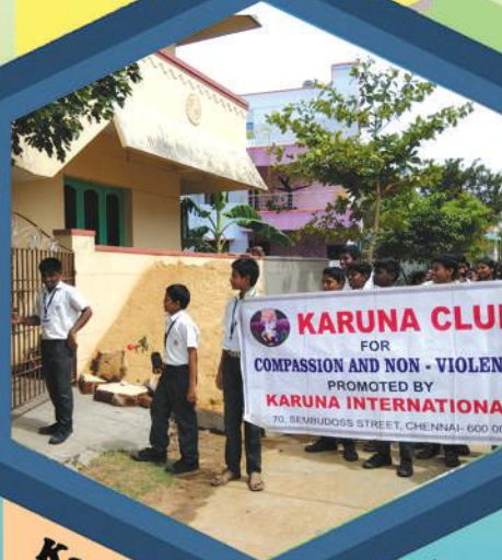
Karuna Club Activities