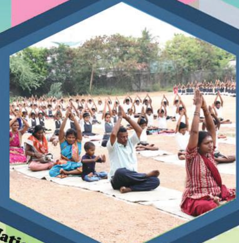
National Yoga Day

A SIMPLE CELEBRATION & GATHERING WISHES GREAT HAPPINESS AND JOY THAT NEVER ENDS.