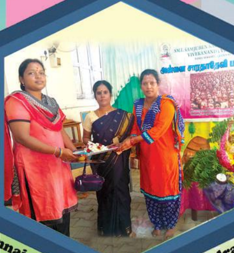
Annai Saratha Devi Mahalir Mandram