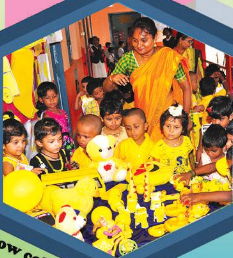
Yellow colour Day